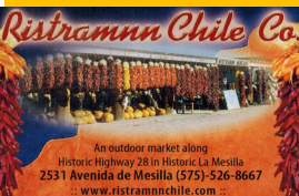
Ristrann Chile Co