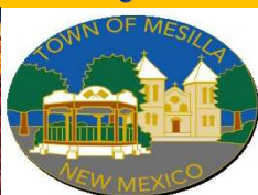
Town of Mesilla